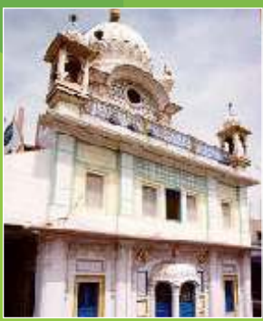
Gurudwara Sri Kandh Sahib Batala